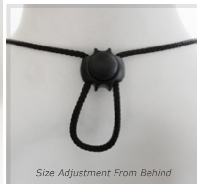
Size Adjustment From Behind

Model: RP27156231 Mammary Gland Cover for Children