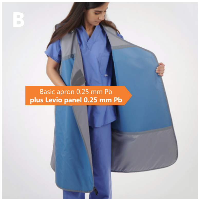
Basic apron 0.25 mm Pb plus Levio panel 0.25 mm Pb