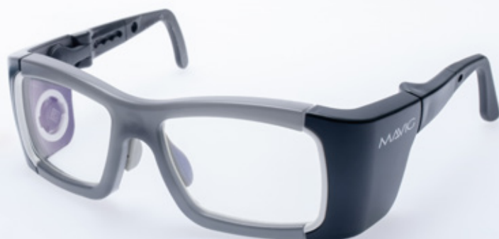
BR330 radiation protection glasses with right side dosemeter connection (Obsidian Grey/Black style shown)