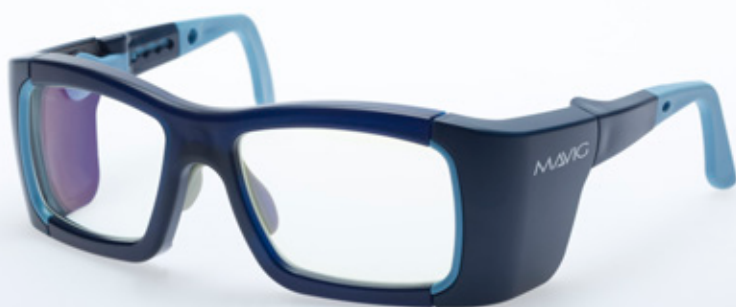
BR330 radiation protection glasses without dosemeter connection (Ocean Blue style shown)