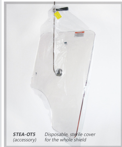
STEA-OT5 (accessory) Disposable, sterile cover for the whole shield

Article Codes: OT50001I Shield complete with Portegra2 Suspension Arm (extension arm length 75 cm) E-OT25B05I Replacement Shield and Connection Bar