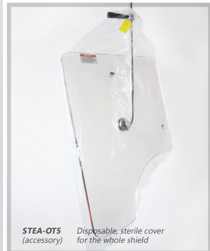
STEA-OT5 (accessory) Disposable, sterile cover for the whole shield

Article Codes: OT50001 OT90001 E-OT25B05