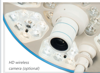
HD wireless camera (optional)

Sterilisable Handle for convenient positioning and focusing