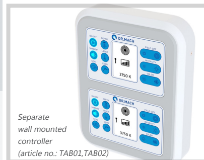
Separate wall mounted controller (article no.: TAB01, TAB02)