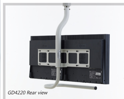
GD4220 Rear view