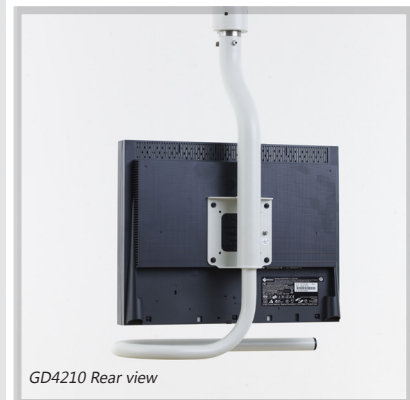
GD4210 Rear view