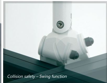
Collision safety – Swing function